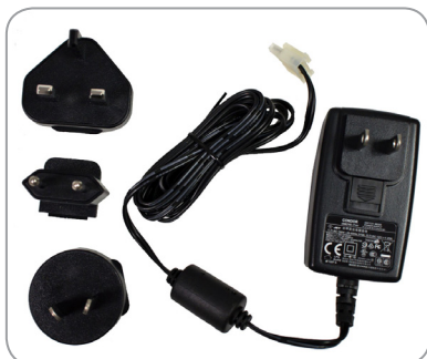
AC Adaptor Kit 14-21244 includes interchangeable US, UK, Continental Europe and China electrical connectors.

1. Tested in accordance with ANSI/ESD STM3.1-2006.