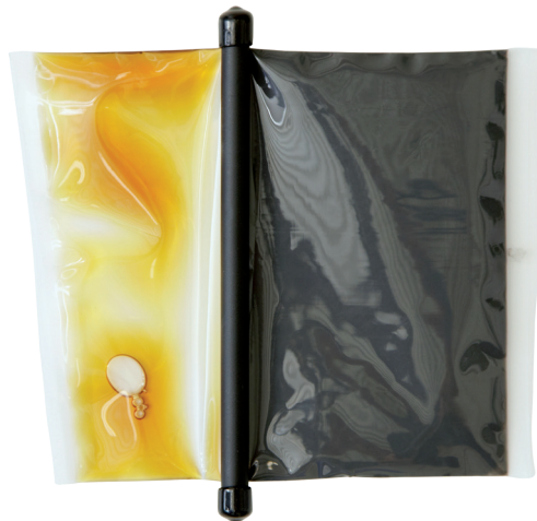
IML Easycore 2 component resin

The IML Easycore comes in duo-packs consisting of the resin and the correct amount of hardener. Package sizes of 250 g are available.