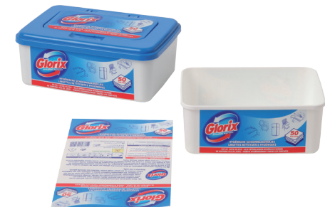
Example product realisation