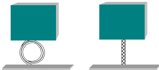
Figure 3. Grounding with High and Low Impedance Path

While for 50/60Hz and for DC regular long and often coiled ground wires may be sufficient, for high frequency signals they present significant impedance resulting in significant levels of high-frequency voltage on ground of operating tools.