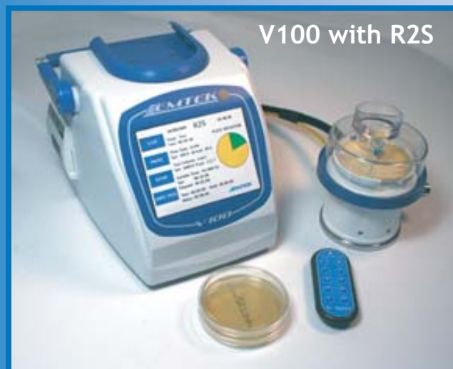
V100 with R2S