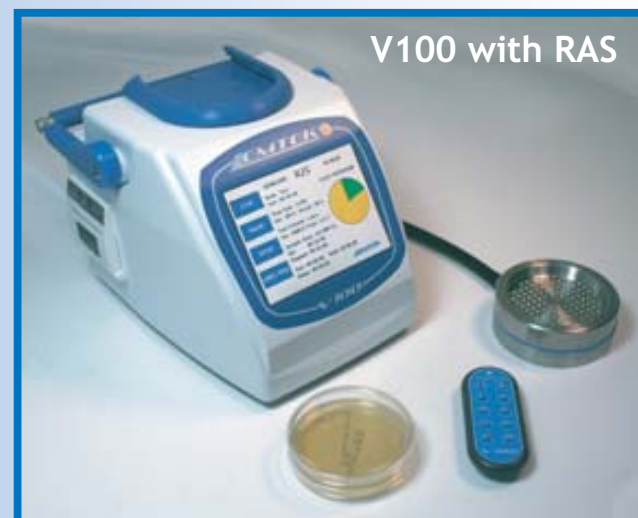
V100 with RAS

Contact EMTEK or your local area representative for additional product information and pricing.